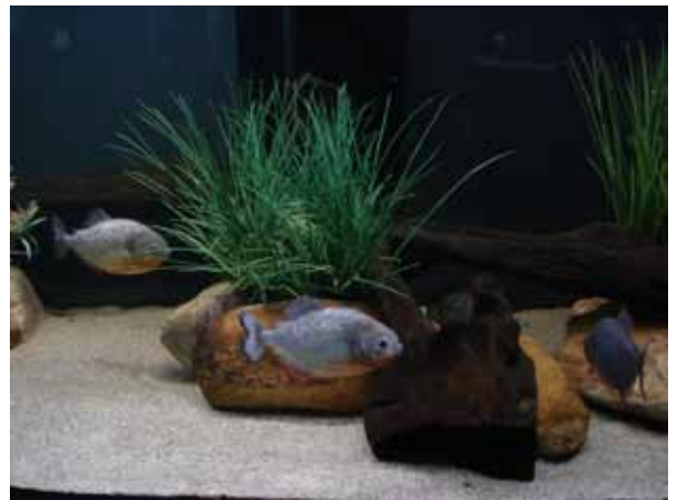
Red-bellied piranha ( Pygocentrus nattereri ) at the Aquário de São Paulo

Still in the starting phase of collecting behavior data through observation before enrichment, we have noticed in our project that the Piranhas are expressing excessive cannibalism, and the Seahorses are spending very little time swimming and feeding. Through the use of enrichment, we expect to reduce aggression and enhance the natural activity of these species.