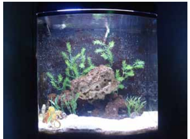
Sea-horses ( Hippocampus reidi ) at the Aquário de São Paulo.

Alongside SHAPE-Brasil we've had the unique opportunity of getting close to the flying foxes ( Pteropus vampyrus ) from the Aquário de São Paulo. Some of these animals have started to better explore their environment after the enrichment's implementation, moving to branches that weren't very often used or explored before. The training and conditioning has also brought many positive results, even an animal flying inside the enclosure was recorded, a very rare situation in a small captivity.