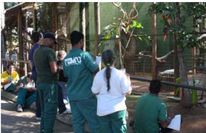
Employees of the Zoológico Quinzinho de Barros, in Sorocaba, making the ethogram under the supervision of SHAPE-Brasil's training team.