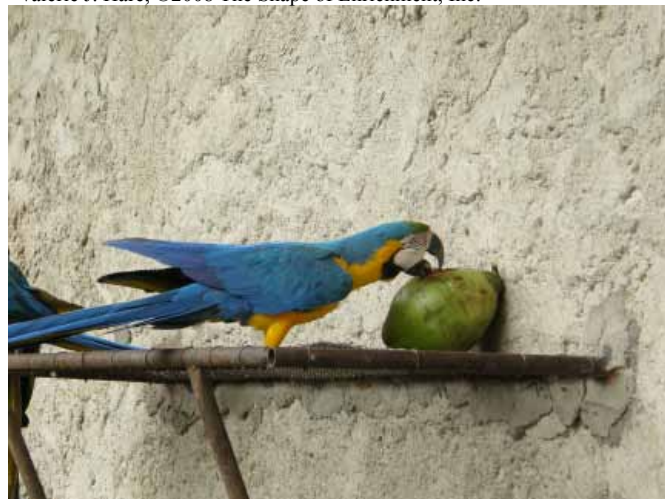
The perches and the whole coconut received the most, and immediate, attention. This fellow didn't even wait for us to leave the enclosure before claiming a coconut.