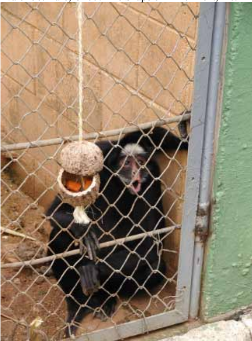
This spider monkey loved his outside-the-enclosure feeder but didn't appreciate the audience!