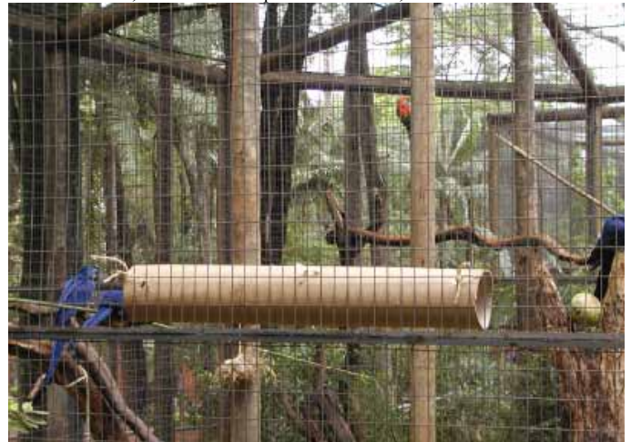
Cardboard carpet tubes were a great addition to the blue macaw enclosure. The macaws walked on top of and through the tube.