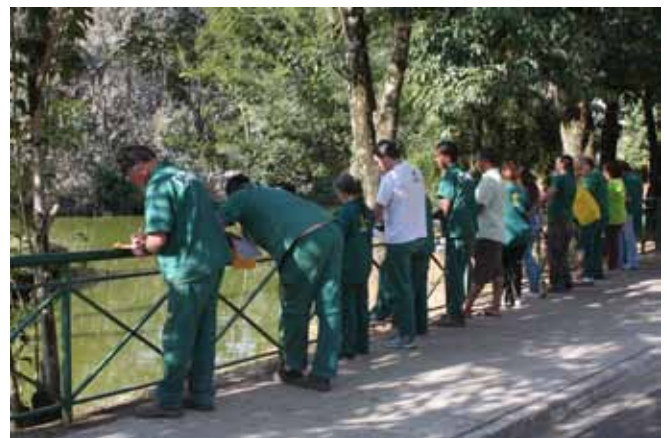
Team elaborating the ethogram.

All of the theory that was presented to them was rescued during the time of the practical part. The most surprising thing was the capacity and creativity of the participants while making the enrichment items. .